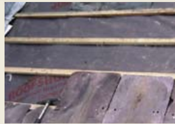
The South Vestry roof has been refurbished.

inspiring how the village united to achieve our objective. A wide variety of events brought everyone together and produced a great deal of pleasure.