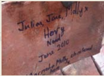
Many of you bought tiles and signed them. They have been included with the new Chancel roof.