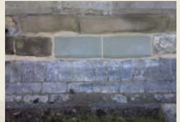
Replacement stone work and lime mortar pointing.