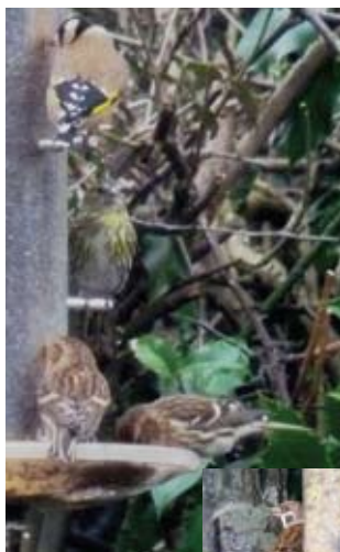
Above: Goldfinch, Siskin and two Lesser Redpolls