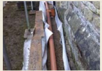
New drainage all around the Church will reduce damp in the future.