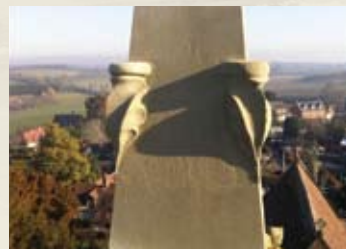
The replacement Aedicule has been carved and partly replaced.

Thanks to everyone who contributed financially and by giving their time and effort. It was amazing that we managed to reach our goal in these difficult financial times in such a short time and it was wonderfully