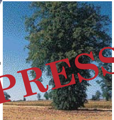
The fields off Park Lane

This is a very serious threat to the character of the community and would fill in some of the important green spaces that keep Snitterfield special.