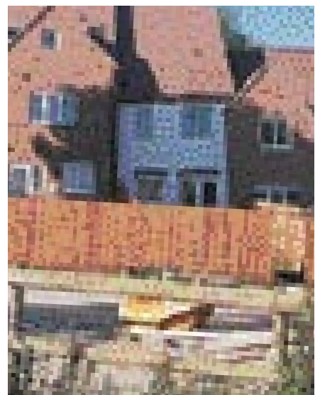
New developments on Park Lane

A spokesman for the Parish Council said that they would 'resist these opportunistic developments and are looking into how they relate to Local Planning policies and National policies concerning green belt and housing needs'.