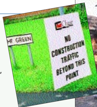
New 3 storey houses dwarf the cottages and houses on The Green

Of concern at the moment to all residents is the number of large, heavy lorries delivering materials to the building sites. Earlier objections were raised at meetings of the previous parish council about the movement of heavy vehicles through the centre of the village, especially down The Green and over the culvert, but to no avail.