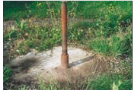
- before and after

The Parish Council recently refurbished the play areas within the village after vandalism attacks - let's keep the areas looking as good as new for our young ones.