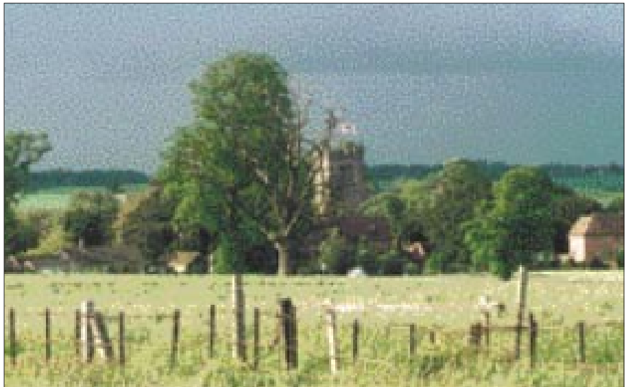
Snitterfield village in 2002, but will it still look like this by 2010?

Their main aims are to maintain and improve the environment of the Parish of Snitterfield and to create awareness among residents of conservation issues. It intends to achieve this by recording and cataloguing all the things that the residents value within the Parish. This could be a beautiful view, buildings, a tree, a pond, a stile, a post box, an allotment, the village shop - in fact anything that