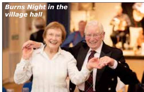
Burns Night in the village hall

has, until recently, taken place each Monday in the hall. If anyone would be interested in starting the group up again, we would very much like to hear from you and if there are other groups that you would like to consider setting up please let us know (contact details below).