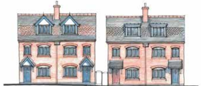
Elevation Towards Road