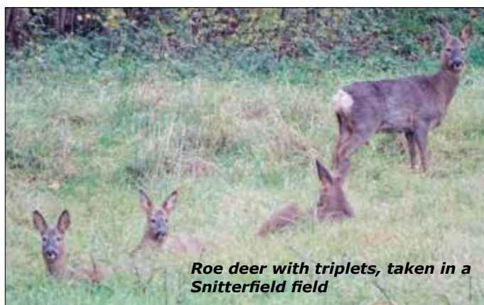
Roe deer with triplets, taken in a Snitterfield field

They are mostly solitary animals but do form small groups in winter and sometimes while feeding in open fields. In the