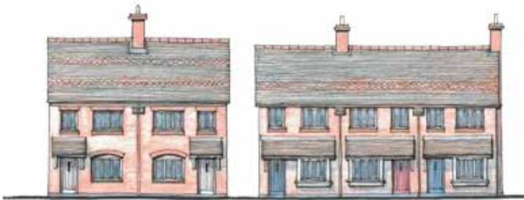
Elevation Towards Tennis Courts